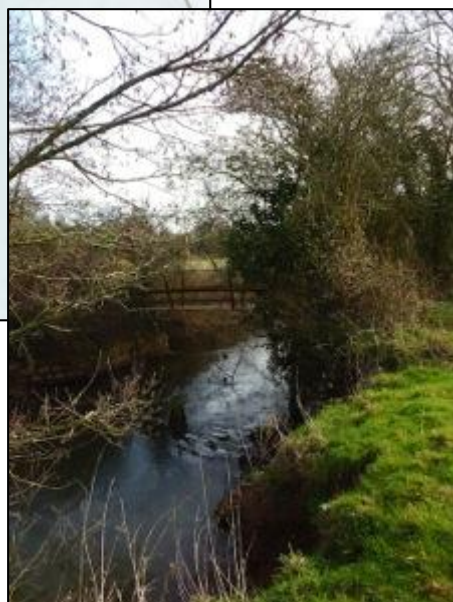
The little iron bridge across the Tone below Runnington